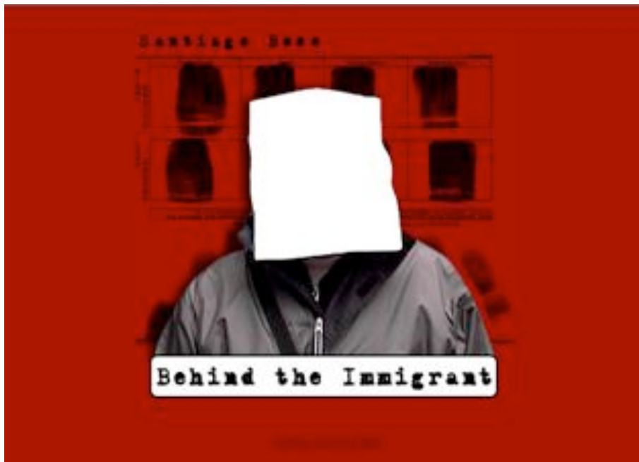
Santiago Bose Behind the Immigrant, 2000 Acrylic painting

The late Santiago Bose was a leading figure in the rise of Philippine contemporary art in the revolutionary and post-Marcos era. He was the subject of Centre A's first artist-in-residence project in the fall of 2000. He produced a series of paintings and an exhibition on the relationships between Asian immigrants to Canada and indigenous First Nations. Bose himself was of mixed race ancestry, descendant from Bengali immigrants to the Philippines and Igorot people.