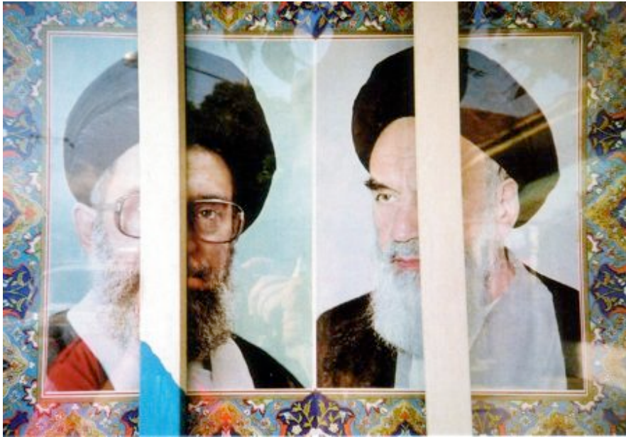
Mo Salemy Exhumed: Deliberating R.M. Khomeini, 2002 Photographs

One year after the attacks of 9/11, this provocative exhibition confronted the stereotype image of Iran presented by the Western media. Blurring the line between reality and fiction, documentation and fantasy, Salemy played with the concept of an “official” state-sponsored exhibition. They were part of Mo Salemy’s first solo exhibition in Vancouver.