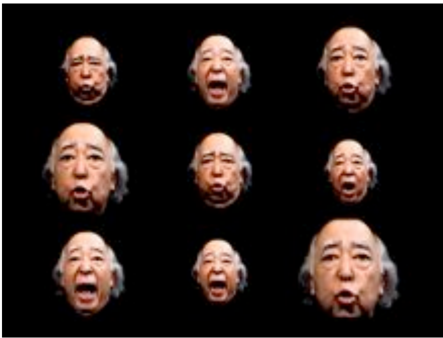
Nobuo Kubota Loophole , 2004

Nobuo Kubota was the first artist whose work was sponsored by Centre A in a performance piece presented at the Powell Street Festival in the summer of 1999.