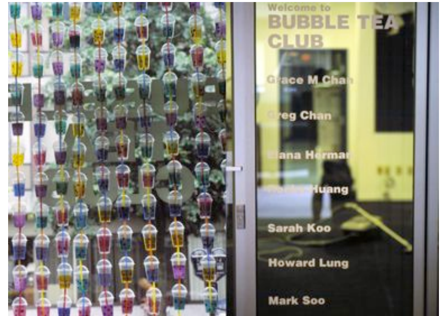
Bubble Tea Club Poster, 2000

The first exhibition in North America of contemporary art from Okinawa involved the Vancouver Okinawa community and the Japanese language school in a one-day workshop which featured calligraphy, dance, music and traditional Okinawan cuisine. The exhibition featured work by three artists from Okinawa, including Maeda Hiroya, whose lacquer works extend the formal possibilities of a medium for which Okinawa is traditionally famous.