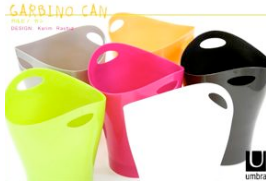
Karim Rashid Umbra Garbino , 2000 Waste basket

In its formative stages, Centre A imagined itself as a collecting institution. This important work was donated by the artist and was the gallery’s first acquisition.