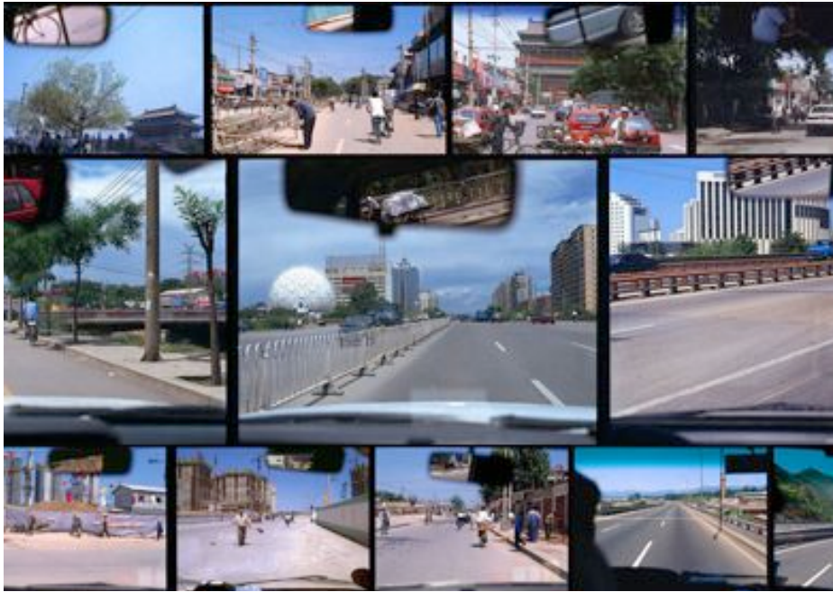
Hong Hao Qingming Shanghe Tu , 2000 Photo

Hong Hao is well known for his work in “re-mapping” Chinese epistemologies. This photographic hand scroll is based on a celebrated Song Dynasty painting by Zhang Zeduan.