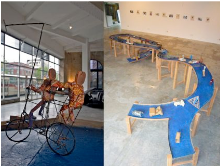
Shen Yuan Blue freeway, 2007 Set of seven ink drawings

Shen Yuan produced a large installation based on handmade made toy vehicles – cars, boats and planes – created by young people in a residency in Zaire (now Republic of Congo). This suite of prints was produced at that time.