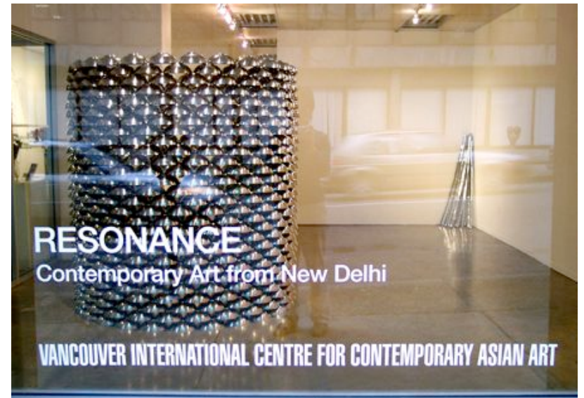
Subodh Gupta Untitled fragment, 2004 Steel bowls