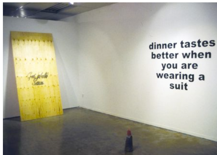
Jinhan Ko Get Well Soon, 2002 Installation

One of leaders of the Indonesian new wave, Heri Dono is recognized as a pioneer of Asian contemporary art. His residency was shared with The Western Front, where he worked with local dancers and artists to produce a political shadow play performance.