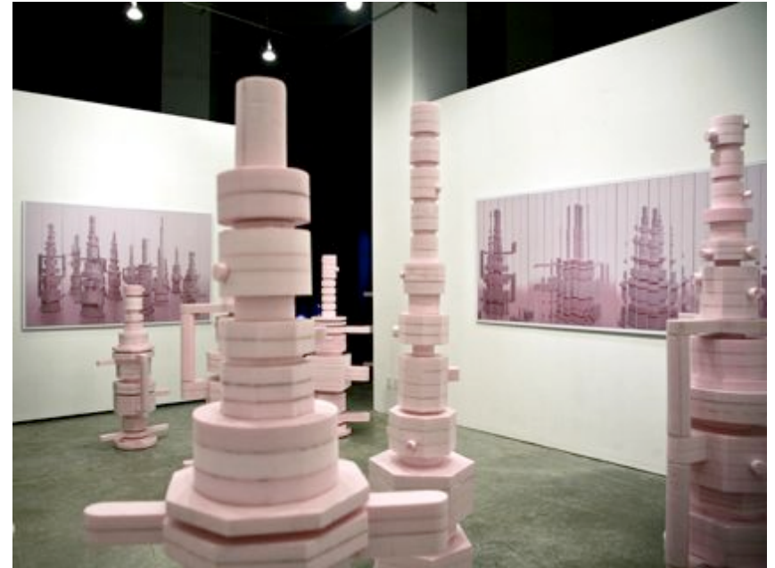
Louise Noguchi Shanghai Dragon (Moisture Forms) , 2008 Photographs

Noguchi examined the role of the heroic landscape in Hollywood action films such as Star Wars , Enter the Dragon , and The Lady from Shanghai . The artist recreates props from these movies remaking them in materials different from their original in order to give the work a new context. By using a photograph to represent the mirrors and sculptures of the objects within the reflections, viewers will not be able to locate themselves within their environment. This new space is reminiscent of film space where one is an unseen participant in a scene.