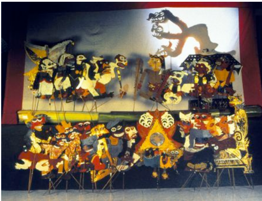
Heri Dono Interrogation, 2002 Shadow puppets

One of leaders of the Indonesian new wave, Heri Dono is recognized as a pioneer of Asian contemporary art. His residency was shared with The Western Front, where he worked with local dancers and artists to produce a political shadow play performance.